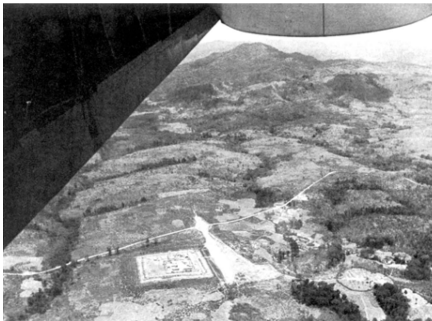
Dak Seang resembles a fort of the early American West. The surrounding territory is not secure. Caribous frequently draw fire on takeoff and landing, but pilots call it routine.

Touchdown at Pleiku is under a hot midmorning sun. Within minutes the paratroopers are on board and the Caribou is headed for the drop zone. The jump is routine. The Caribou returns twice to Pleiku for additional loads.