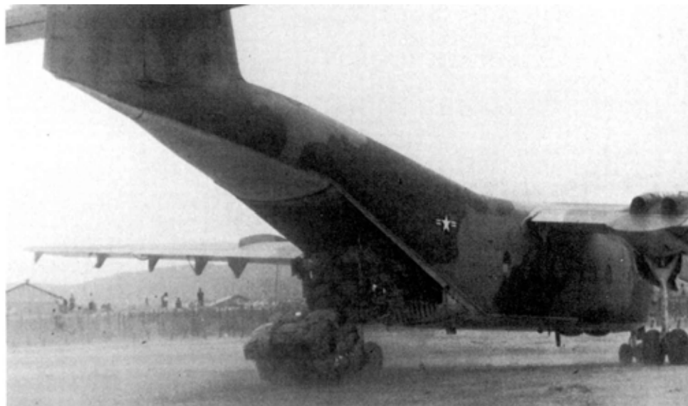
There are many techniques for getting cargo out of the Caribou . At Dak Seang, a remote Special Forces camp, the crew demonstrated the Ground High Speed Offload method. As the Caribou lurches forward, pallets fly out the rear door. Pallets held fiber bags for sandbagging the fort .

ics. There's an ex-Thunderbird pilot and a former NASA pilot. One of the lieutenant colonels was a double ace in World War 11; another a single ace. Still another was pilot of an ultraspeedy B-58 Hustler before "moving up" to the Caribou . Aircraft commanders run the grade ladder from first lieutenant to colonel.