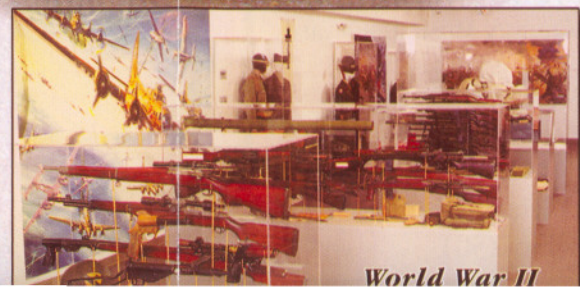
World War II