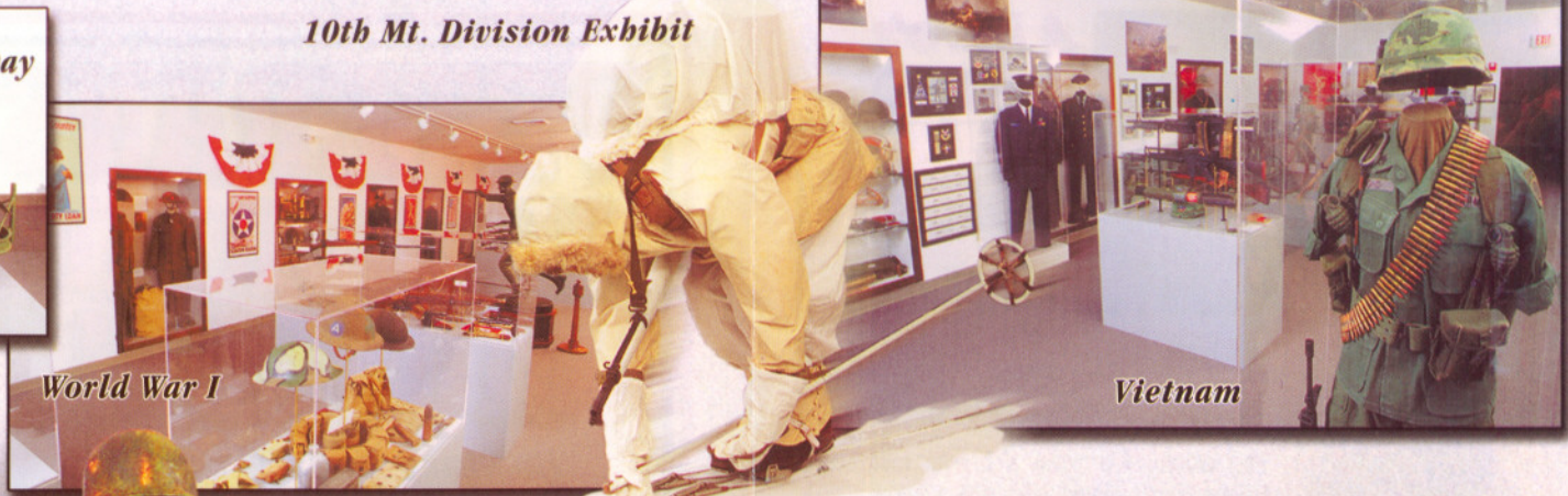
10th Mt. Division Exhibit