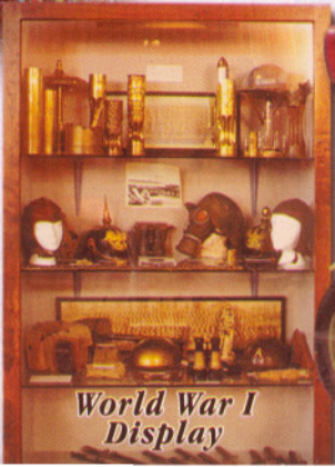
World War I Display