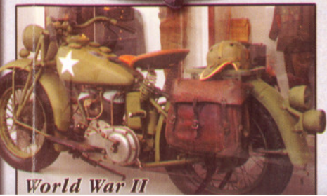
World War II