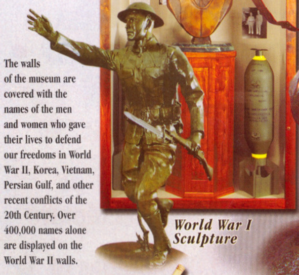
World War I Sculpture

The walls of the museum are covered with the names of the men and women who gave their lives to defend our freedoms in World War II, Korea, Vietnam, Persian Gulf, and other recent conflicts of the 20th Century. Over 400,000 names alone are displayed on the World War II walls.