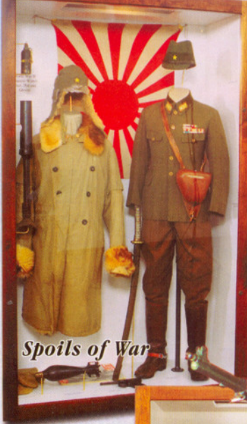
Spoils of War